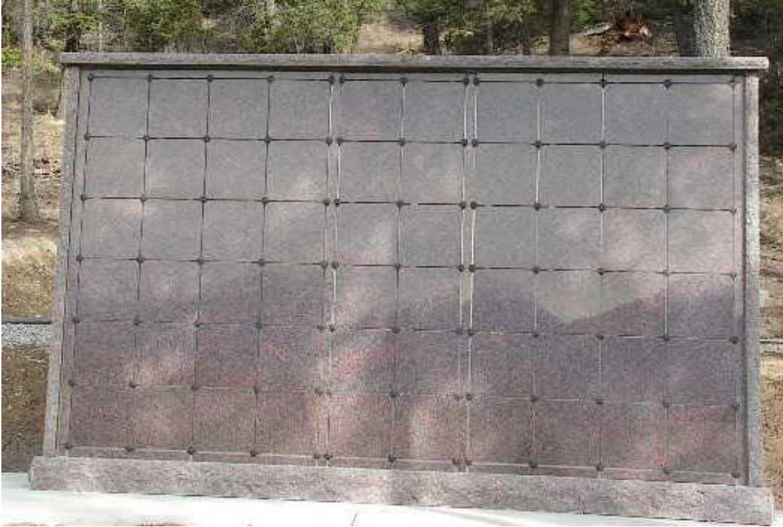
Columbarium with 60 Niches