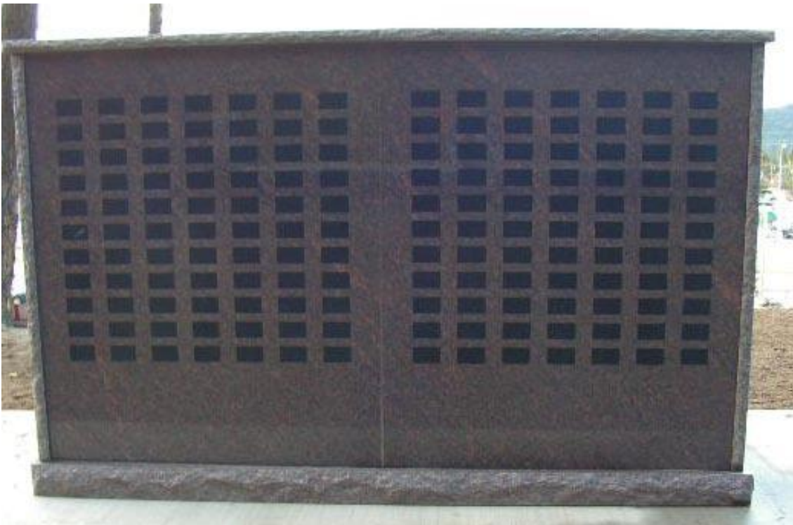
Memorial Wall with 154 Spaces