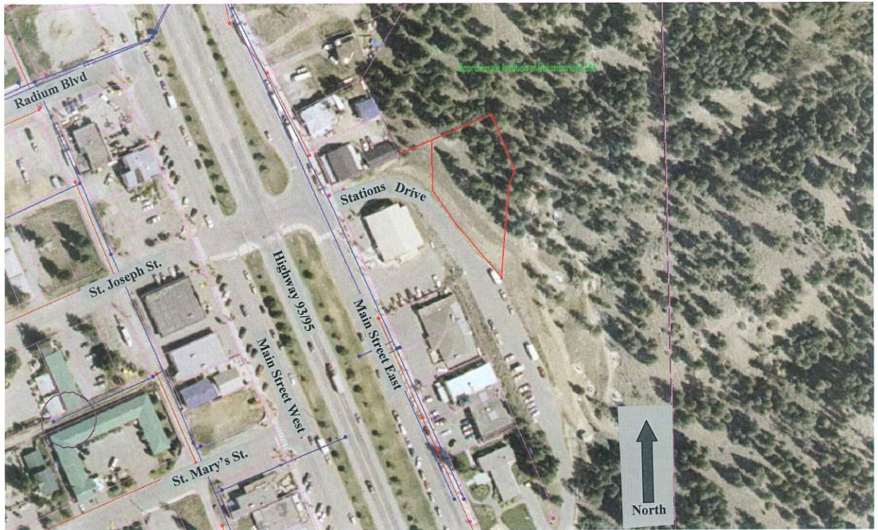
Location of the Columbarium is outlined in red. Address: 7524 Stations Drive